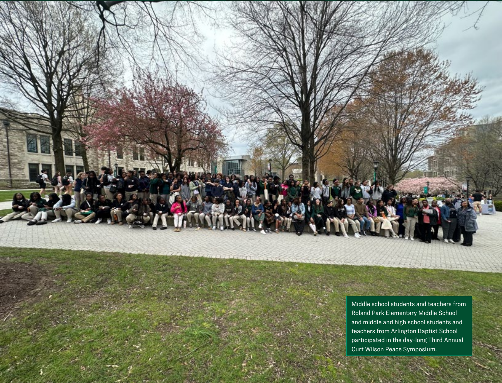
Middle school students and teachers from Roland Park Elementary Middle School and middle and high school students and teachers from Arlington Baptist School participated in the day-long Third Annual Curt Wilson Peace Symposium.